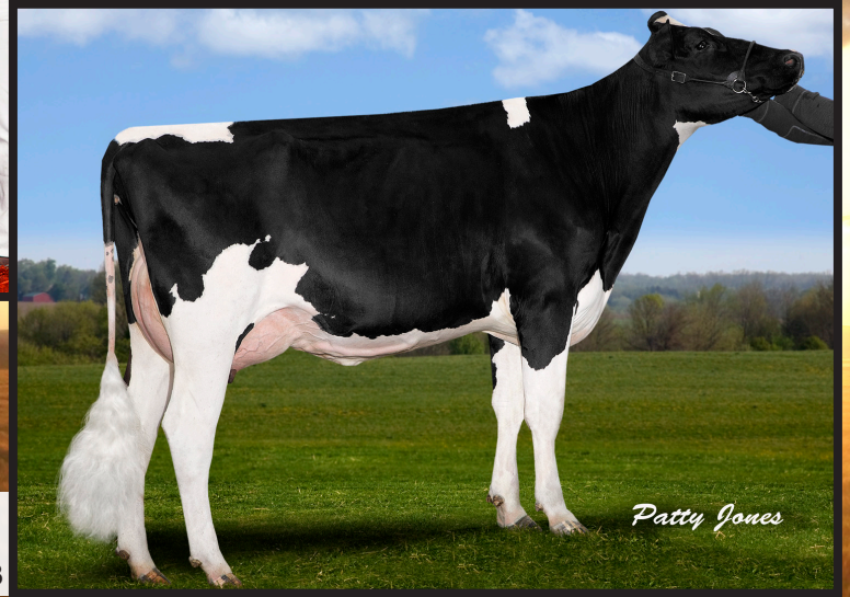
Autumn Breeze 2nd Jr. 2-Yr- Old Tri-County '13