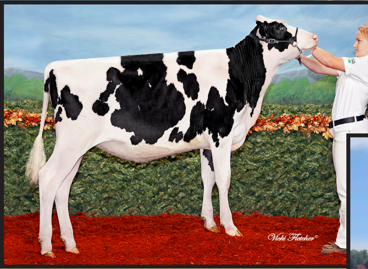
Buttertart 3rd Jr. Calf Tri-County '13 7th Jr. Calf 'The Classic' '13