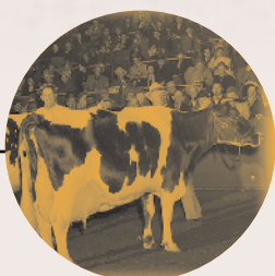
Spring Farm Juliette, Reserve, & Rosehill Fayne Wayne, Grand - 1951