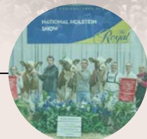
2016 RWF FERME ROLANDALE RW BANNERS 2016

Two cows have been Grand Champion three times in the Red & White Show: Blondin Redman Seisme (2010-11-12) and Meadow Green Absolute Fanny (2016-17-19). Elmbridge FM Loveable Red was Grand Champion in 2008-09, and her daughter, Elmbridge Lookout Lady In Red, took Grand in 2013. Three generations of Loveables were class winners in 2013. Three different Red & White Grand Champion cows have carried the Blondin prefix.