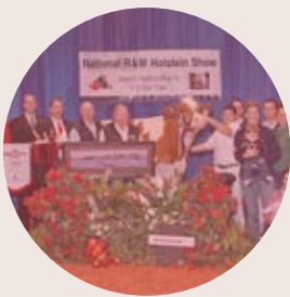
FIRST R&W SHOW CHAMP 2007 - PARILE KITE ALICIA

The first National Red & White Holstein Show was held at the Royal in 2007. Following its creation, Red & Whites were not allowed to show in the Royal's Black & White Show from 2007-13. In 2014, a challenge to that rule resulted in one R&W cow showing in the B&W Show. While R&W had the option of showing in either show in 2015, by 2016 they were required to show first in the R&W in order to compete in the B&W Show.