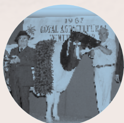
Brookview Tony Charity RWF 1987 Presentation