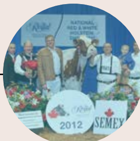
2012 RW GRAND-BLONDIN REDMAN SEISME

The first National Red & White Holstein Show was held at the Royal in 2007. Following its creation, Red & Whites were not allowed to show in the Royal's Black & White Show from 2007-13. In 2014, a challenge to that rule resulted in one R&W cow showing in the B&W Show. While R&W had the option of showing in either show in 2015, by 2016 they were required to show first in the R&W in order to compete in the B&W Show.