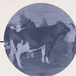
Agro Acres Marquis Xmas Pansy and Marquis Patsy, 1969