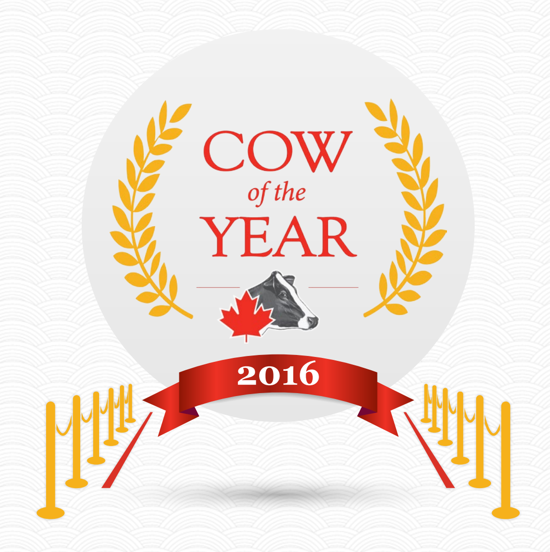
Every year, a star is born...