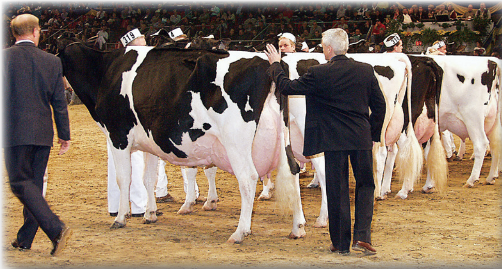
Moving into position, the ringman directs leadspersons in parading their animals.

contestants to line up their animals in a secondary straight line. Do not make this line too close to the first line. Leave some room for the judge to work with the first pulls. Once the second line is in place, notify the judge the second line is ready for viewing. He just might find an animal he missed in the first pull, and that