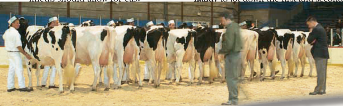
The ringman supports the judge, but does not interfere with the judge's role.