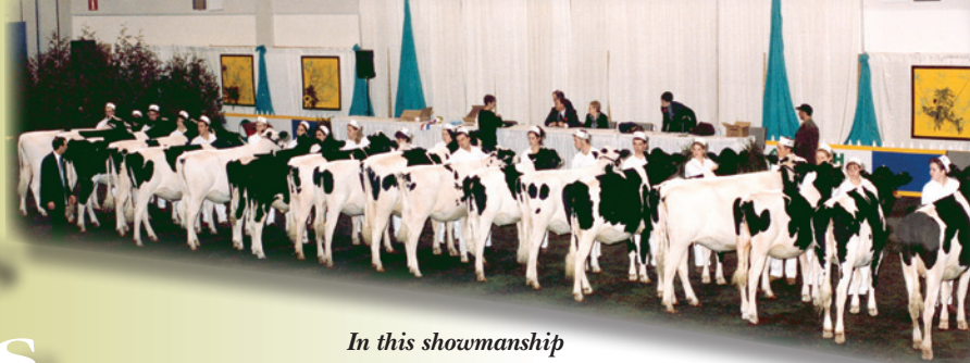
In this showmanship class, the ringman remains inconspicuous.