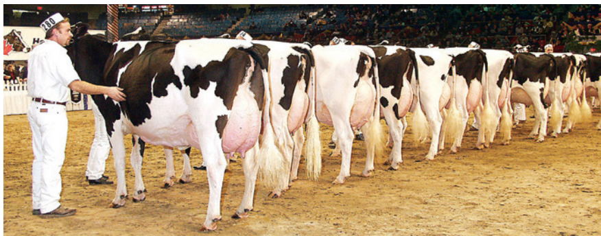
The final lineup is a straight line initiated by the ringman.

If an animal soils her tail, be prepared to take the halter for a few moments while the leadsperson ties the cow up.